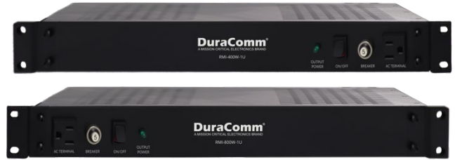
RMI-400W-1U (top) & RMI-800W-1U (bottom)